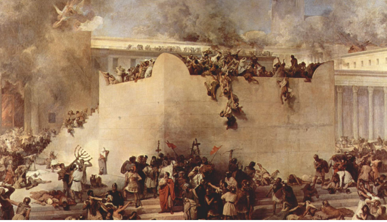
Painting by Francesco Hayez