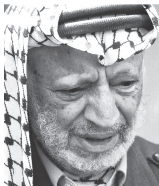
Yasser Arafat was the most well known of the PLO leaders

During the War of Attrition, from 1967–1970, the PLO, which was then based in Jordan, launched attacks on the Beit Shean region. Israel responded by entering Jordan with force, retreating only under Jordanian military pressure. In September 1970, known as Black September, King Hussein of Jordan launched an attack on the PLO, hoping to reestablish his monarchy over the land, as the Palestinians in Jordan were severely undermining the rule of law in that country.