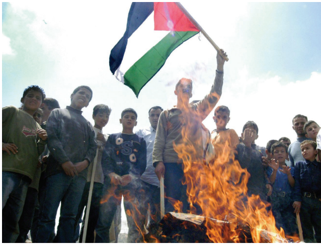
Palestinians protest by burning Israeli and American flags, falsely accusing America and Israel of being the leaders of world terrorism

engaged in an act of aggression against Israel. Israel has responded.” German Chancellor Angela Merkel added her voice, laying the blame for violence at the feet of Hamas.