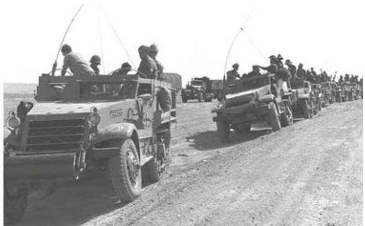
A column of armored half-tracks manned by IDF reservists during the Six-Day War in 1967

The end of 1964 brought more war and terror to Israel's borders, starting with the founding of the Palestinian Liberation Organization (PLO), which encouraged and supported guerrilla tactics against Israelis. In 1964, Israel completed work on the National Water Carrier, which would divert water from the Jordan River into the south of Israel, fulfilling Ben-Gurion's dream of cultivating the Negev region. The Water Carrier became a source of tension between Israel and Syria, though, as the Arabs attempted to divert the water out of Israel's reach. Terrorist raids across the Jordanian and Egyptian borders increased, and again, Egypt moved large amounts of troops into the Sinai Peninsula and blocked Israel's access to the Straits of Tiran. Israel faced hostility on three borders—