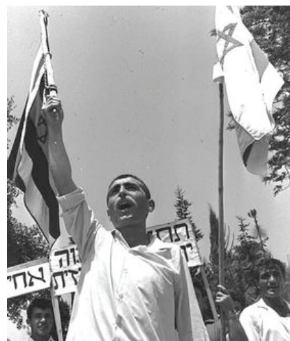
Young Druzes from Dalyat El Carmel express their solidarity for Israel during the Six-Day War

Israel responded to the military attacks, and both sides suffered heavy casualties. During this war, Prime Minister Levi Eshkol died in office of a heart attack and was succeeded by Golda Meir, who was the first female Prime Minister of Israel, and the only woman to have led a Middle Eastern state in modern times. Finally, the War of Attrition came to an end in 1970, as Egypt and Israel signed another cease-fire agreement. Egypt had gained nothing during the war, as the cease-fire lines remained the same as they did after 1967.