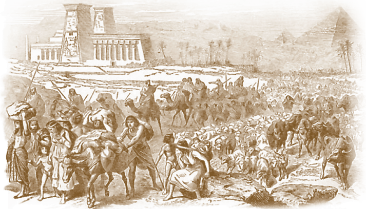
The Israelites are led out of Egypt to the Promised Land

Examples abound: Ezra and Nehemiah, who brought the Jews back from Babylonian exile and eventually rebuilt the Second Temple; and Nahmanides and Judah HaLevi, among others, two great scholars from the Middle Ages who gave up their home in the Diaspora to move to Israel. This is only a small part of the list, of the people and families whose life goal was to resettle their homeland. For those Jews who remained in the land where they were exiled, the term “Diaspora” was applied, meaning a voluntary separation and intentional choice not to return.