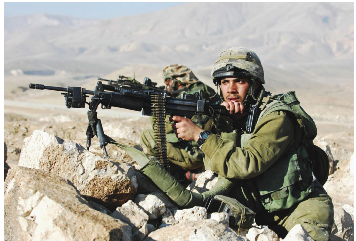
IDF forces are in a state of constant alert along the borders with Gaza, Lebanon, and the West Bank where Hamas and their terrorist stronghold camps are positioned

In 2007, fighting between Fatah and Hamas led to the Battle of Gaza, in which the militant Hamas gained control of the Gaza Strip and forced out Fatah. The Palestinian leadership became divided into the Hamas-controlled Gaza Strip and the Palestinian Authority-controlled West Bank. The fierce battles killed or wounded hundreds of Palestinians and were condemned by Human Rights Watch for violating humanitarian law.