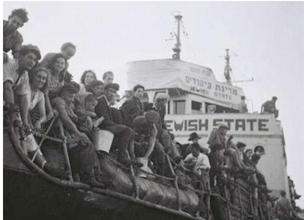
Illegal Jewish immigrants aboard the Hagana ship 'Jewish State' at Haifa Port in 1947

On May 14, 1948, after the last of the British forces left Palestine, David Ben-Gurion declared the creation of the State of Israel. The new state was recognized immediately by U.S. President Harry S. Truman and Soviet leader Joseph Stalin. The neighboring Arab countries—Egypt,