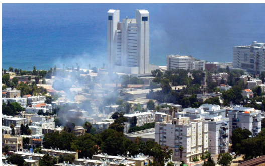
Hamas rockets launched from Gaza hit the city of Haifa in Israel

In the ensuing years, Hamas factions have kept up a steady reign of terrorist attacks against Israel. On December 27, 2008, the Israeli air force struck hard against the terrorist infrastructure in Gaza, in an attempt to bring a decisive end to incessant terrorist rocket attacks that for years have caused death, injury, and trauma to Israeli citizens living in the region near Gaza.