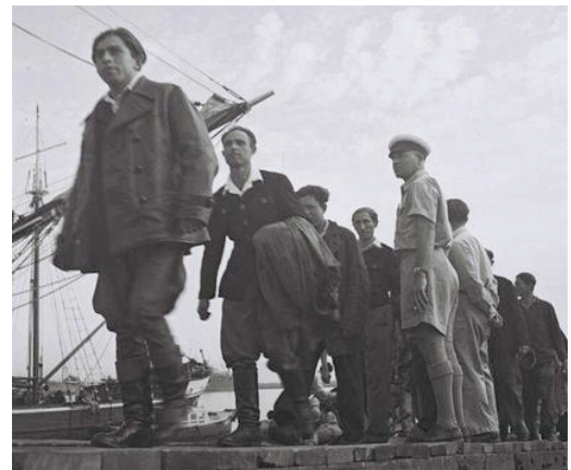
Illegal Jewish immigrants arriving at the Haifa Port in 1946

The UN appointed a special committee, the Special Committee on Palestine (UNSCOP). On November 29, 1947, the General Assembly of the UN voted—with thirty-three countries in favor, thirteen against, and ten abstaining—to partition Palestine into a Jewish state and an Arab state, with Jerusalem remaining under UN