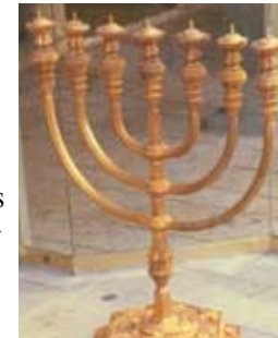
The Temple Menorah is the miraculous focus of Hanukkah

The fate of the city of Jerusalem—and therefore the fate of the Temple—remains a controversial issue among the Arab world and Israel. The Palestinian viewpoint says that Israel's claims to Jerusalem are illegitimate. But Jews made Jerusalem their Holy City three thousand years ago and have been