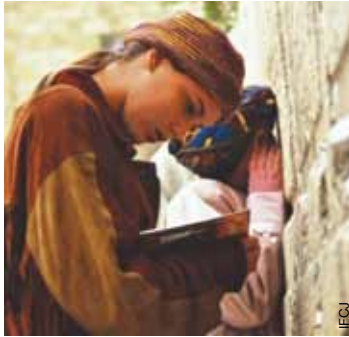
Praying at the Western Wall at the base of the holy Temple Mount

The terrible events we remember on Tisha B’Av remind us of the need to always pray for the peace of Jerusalem and the safety of the Jewish people. Today, let us indeed say a prayer for this city, holy to Jews and Christians alike.